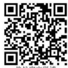
Xinran official Weibo

Shanghai Xinran Compressor Co., Ltd X. E. S. industry (jiangsu) Co., Ltd