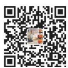
Xinran official wechat